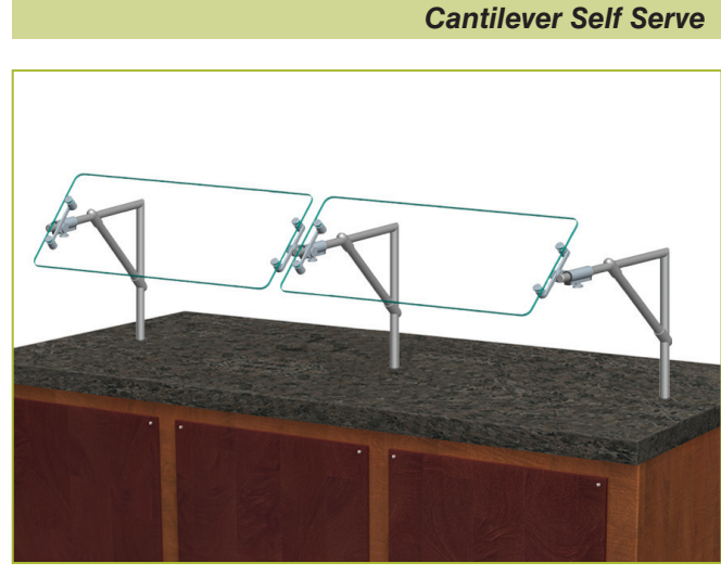
Shown without end panels.

See Installation Page for More Details. Contact BSI for under counter mounting options.